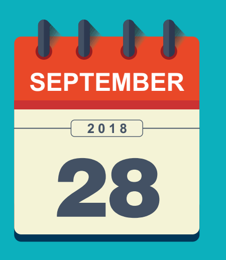
Release of Website