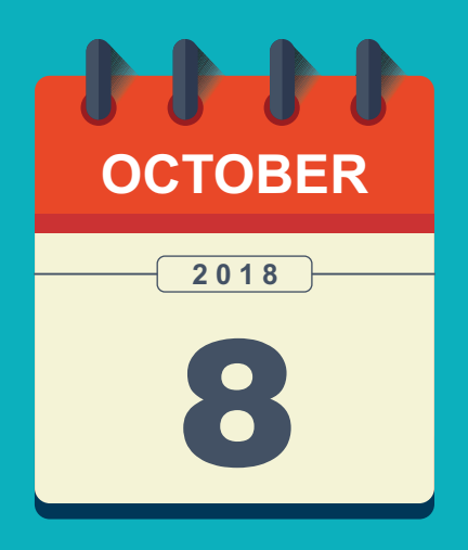
Opening of Proposal Submission Portal